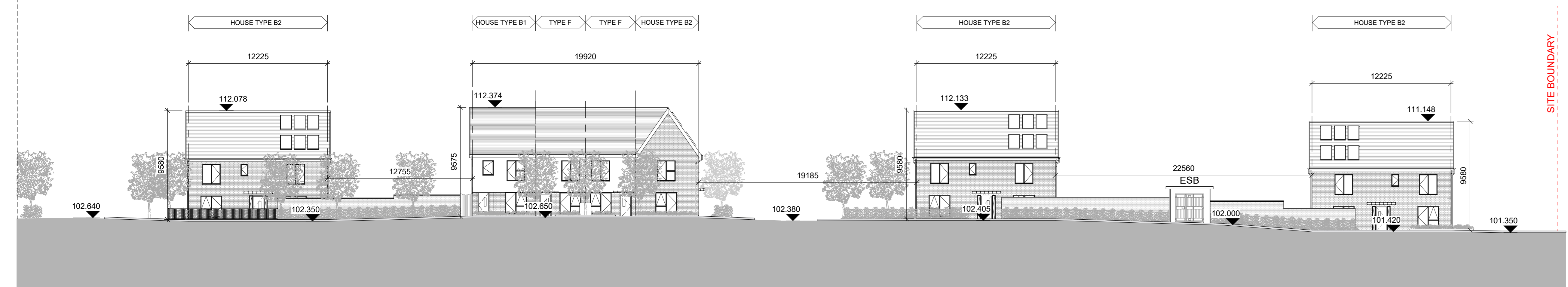
CONTIGUOUS ELEVATION 3-3 (RIGHT) 1:200